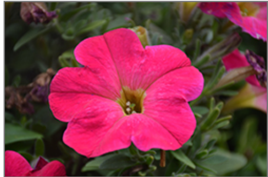
Hells Flamin' Rose Petunia flowers