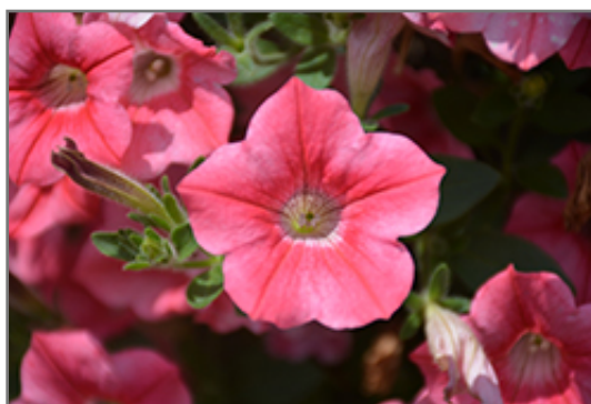
Dekko Star Coral Petunia flowers