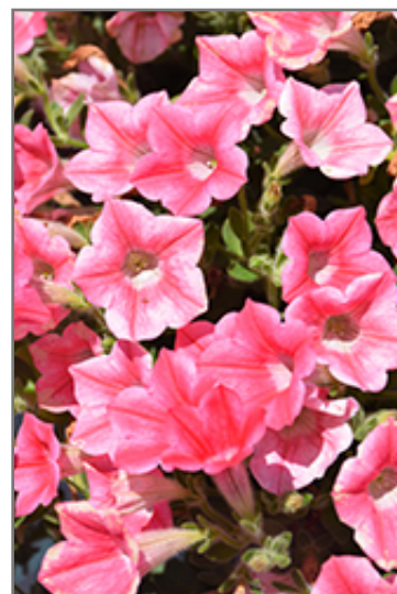
Dekko Star Coral Petunia flowers

Dekko Star Coral Petunia is recommended for the following landscape applications;