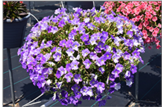
Dekko Sky Blue Petunia in bloom

Dekko Sky Blue Petunia will grow to be about 12 inches tall at maturity, with a spread of 22 inches. When grown in masses or used as a bedding plant, individual plants should be spaced approximately 18 inches apart. Its foliage tends to remain dense right to the ground, not requiring facer plants in front. This fast-growing annual will normally live for one full growing season, needing replacement the following year.