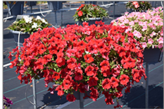
Dekko Red Petunia in bloom

Dekko Red Petunia will grow to be about 12 inches tall at maturity, with a spread of 22 inches. When grown in masses or used as a bedding plant, individual plants should be spaced approximately 18 inches apart. Its foliage tends to remain dense right to the ground, not requiring facer plants in front. This fast-growing annual will normally live for one full growing season, needing replacement the following year.