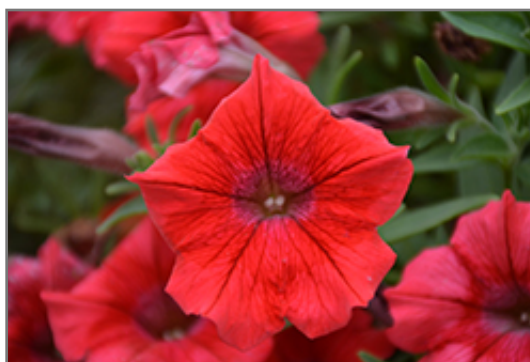
Dekko Red Petunia flowers