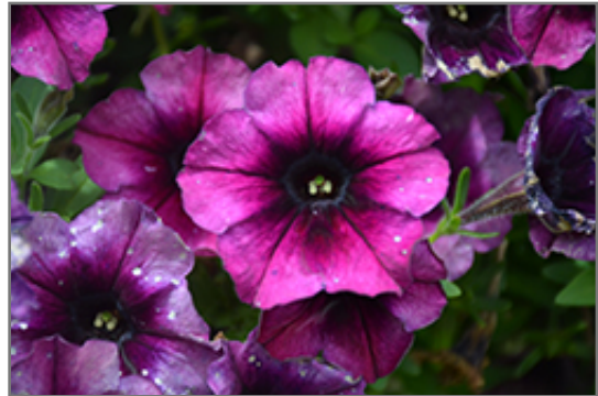
Crazytunia Twilight Red Petunia flowers