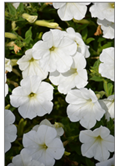
ColorRush White Petunia flowers