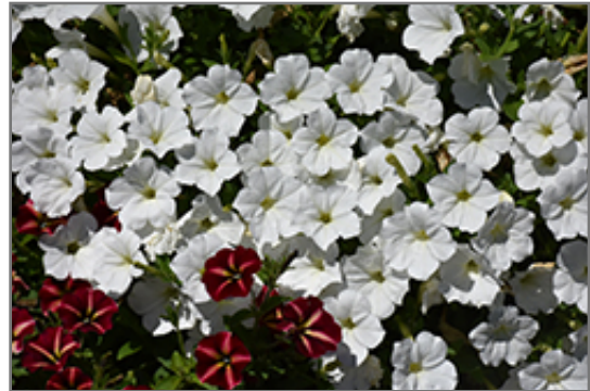
ColorRush White Petunia flowers

ColorRush White Petunia is recommended for the following landscape applications;