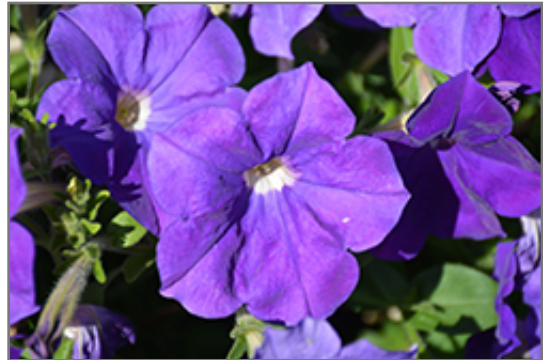
Cascadias Blue Omri Petunia flowers

Cascadias Blue Omri Petunia is recommended for the following landscape applications;