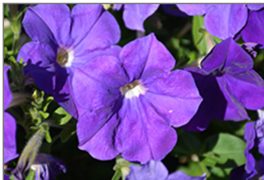
Cascadias Blue Omri Petunia flowers

Cascadias Blue Omri Petunia is recommended for the following landscape applications;