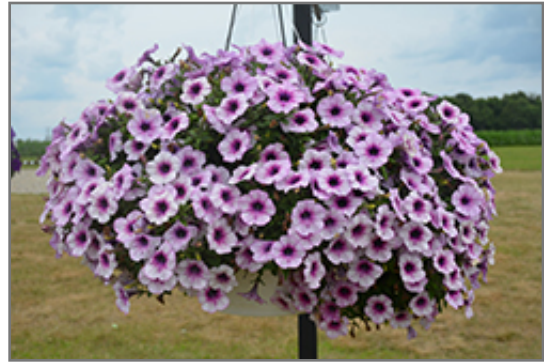
Capella Purple Veins Petunia in bloom

Capella Purple Veins Petunia will grow to be about 12 inches tall at maturity, with a spread of 16 inches. Its foliage tends to remain dense right to the ground, not requiring facer plants in front. This fast-growing annual will normally live for one full growing season, needing replacement the following year.