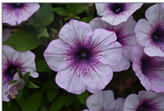
Capella Purple Veins Petunia flowers

Capella Purple Veins Petunia is recommended for the following landscape applications;