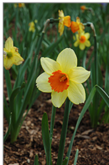
Fortissimo Daffodil flowers