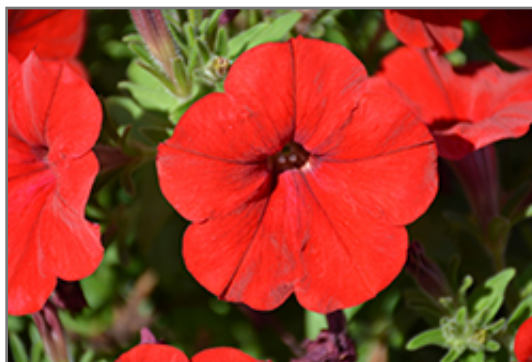
Capella Ruby Red Petunia flowers