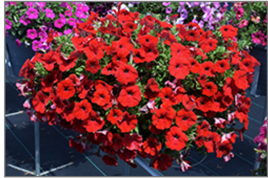
Capella Ruby Red Petunia in bloom

Capella Ruby Red Petunia will grow to be about 12 inches tall at maturity, with a spread of 16 inches. When grown in masses or used as a bedding plant, individual plants should be spaced approximately 12 inches apart. Its foliage tends to remain dense right to the ground, not requiring facer plants in front. This fast-growing annual will normally live for one full growing season, needing replacement the following year.