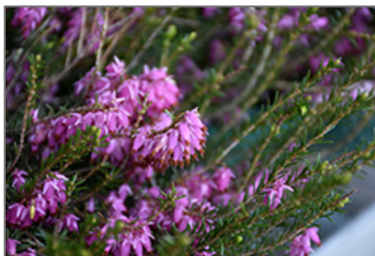
Pink Spangles Heath flowers