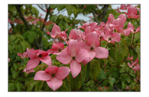
Scarlet Fire Flowering Dogwood flowers

Scarlet Fire Flowering Dogwood will grow to be about 25 feet tall at maturity, with a spread of 20 feet. It has a low canopy with a typical clearance of 3 feet from the ground, and should not be planted underneath power lines. It grows at a slow rate, and under ideal conditions can be expected to live for 40 years or more.