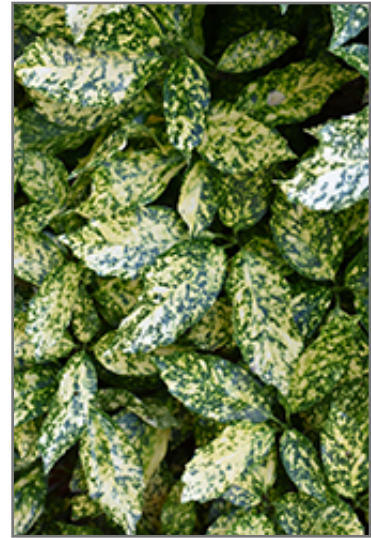
Crotonifolia Aucuba foliage