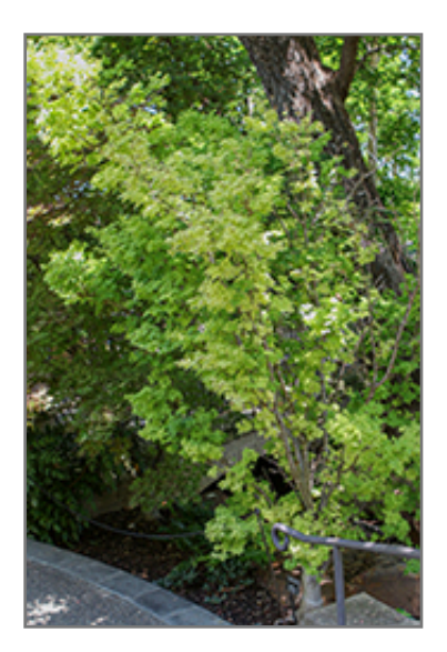
Winter Flame Japanese Maple