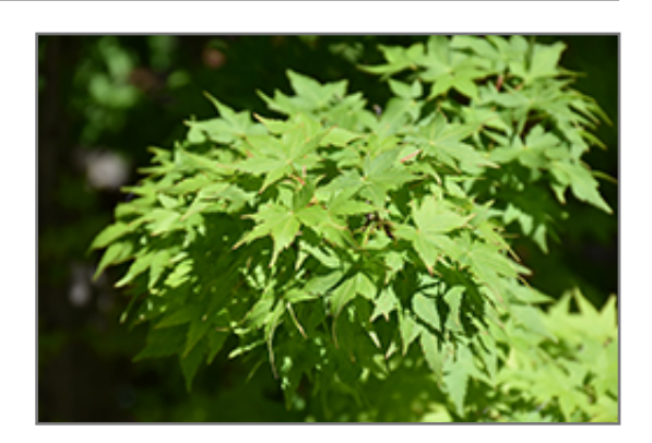
Winter Flame Japanese Maple foliage

Winter Flame Japanese Maple is recommended for the following landscape applications;