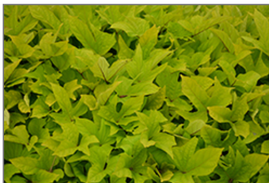
SolarTower Lime Sweet Potato Vine foliage