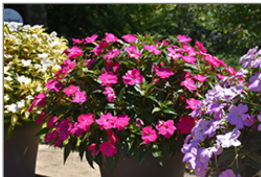
SunPatiens Vigorous Rose Pink New Guinea Impatiens in bloom

SunPatiens Vigorous Rose Pink New Guinea Impatiens will grow to be about 3 feet tall at maturity, with a spread of 3 feet. When grown in masses or used as a bedding plant, individual plants should be spaced approximately 32 inches apart. Its foliage tends to remain dense right to the ground, not requiring facer plants in front. This fast-growing annual will normally live for one full growing season, needing replacement the following year.