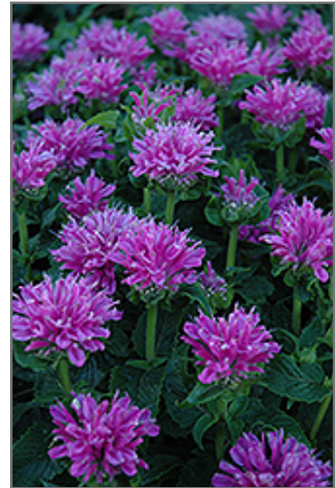
Petite Delight Beebalm flowers