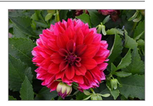
Labella Maggiore Purple Dahlia flowers

A beautiful, long blooming variety that features an upright habit and produces large fuchsia blooms sitting on top of dark green foliage; performs well in containers, garden beds and as borders; great addition to any fresh cut flower arrangement