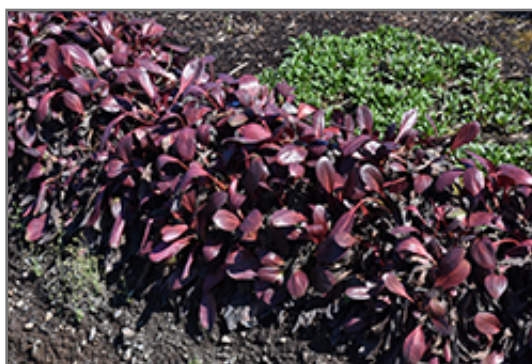
Flirt Bergenia foliage