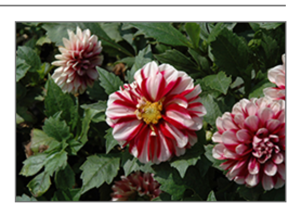
Dalaya Dark Red and White Dahlia flowers

Attractive, dark red and white bi-colored blooms sit on top of well branched, dark green foliage; early to flower and slow to fade, this variety performs well in gardens and containers; stunning as cut flower arrangements; attracts birds and butterflies