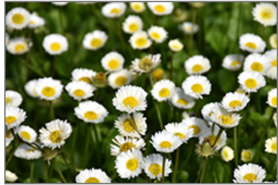
White English Daisy flowers