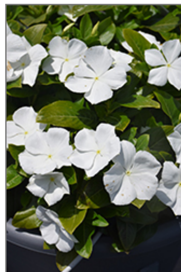
Cora XDR White flowers

Cora XDR White is recommended for the following landscape applications;