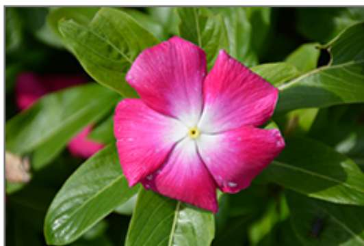
Cora XDR Magenta Halo flowers