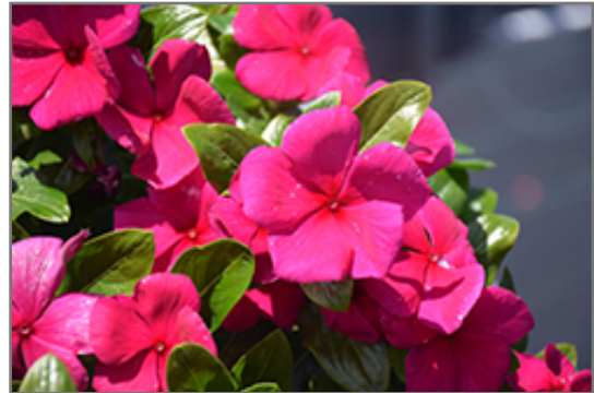
Cora XDR Hotgenta flowers

Cora XDR Hotgenta is recommended for the following landscape applications;