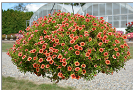
MiniFamous Neo Lava + Red Eye Calibrachoa in bloom