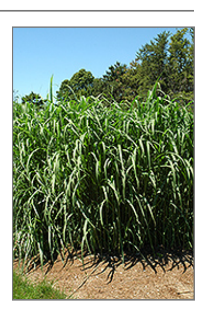
Giant Silver Grass

Giant Silver Grass will grow to be about 7 feet tall at maturity, with a spread of 4 feet. It tends to be leggy, with a typical clearance of 1 foot from the ground, and should be underplanted with lower-growing perennials. It grows at a medium rate, and under ideal conditions can be expected to live for approximately 20 years. As an herbaceous perennial, this plant will usually die back to the crown each winter, and will regrow from the base each spring. Be careful not to disturb the crown in late winter when it may not be readily seen!