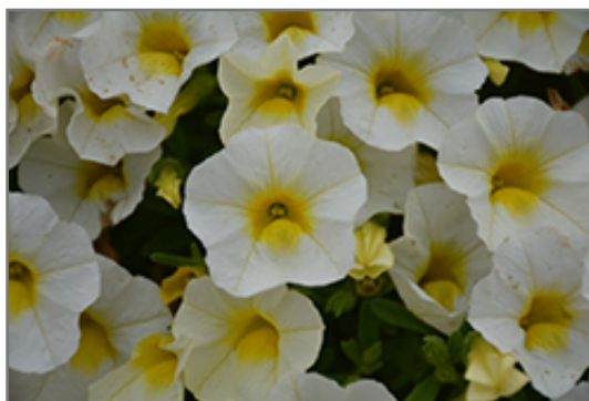
Lia White Calibrachoa flowers

This plant will require occasional maintenance and upkeep. Trim off the flower heads after they fade and die to encourage more blooms late into the season. It is a good choice for attracting bees and hummingbirds to your yard, but is not particularly attractive to deer who tend to leave it alone in favor of tastier treats. It has no significant negative characteristics.