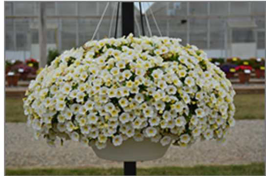
Lia White Calibrachoa in bloom

Lia White Calibrachoa is a fine choice for the garden, but it is also a good selection for planting in outdoor containers and hanging baskets. Because of its trailing habit of growth, it is ideally suited for use as a 'spiller' in the 'spiller-thriller-filler' container combination; plant it near the edges where it can spill gracefully over the pot. Note that when growing plants in outdoor containers and baskets, they may require more frequent waterings than they would in the yard or garden.