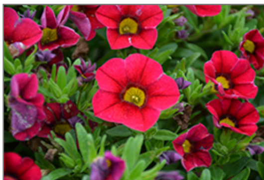
Lia Raspberry Calibrachoa flowers

This plant will require occasional maintenance and upkeep. Trim off the flower heads after they fade and die to encourage more blooms late into the season. It is a good choice for attracting bees and hummingbirds to your yard, but is not particularly attractive to deer who tend to leave it alone in favor of tastier treats. It has no significant negative characteristics.