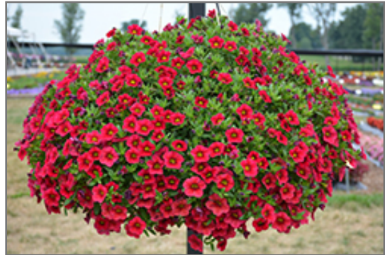
Lia Raspberry Calibrachoa in bloom

Lia Raspberry Calibrachoa is a fine choice for the garden, but it is also a good selection for planting in outdoor containers and hanging baskets. Because of its trailing habit of growth, it is ideally suited for use as a 'spiller' in the 'spiller-thriller-filler' container combination; plant it near the edges where it can spill gracefully over the pot. Note that when growing plants in outdoor containers and baskets, they may require more frequent waterings than they would in the yard or garden.