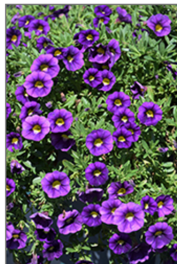
Colibri Plum Calibrachoa flowers

Colibri Plum Calibrachoa is recommended for the following landscape applications;