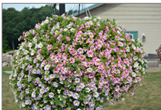
Candy Shop Pixie Stix Mix Calibrachoa in bloom