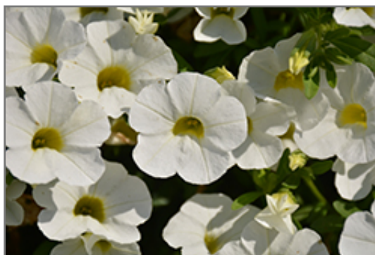
Calitastic White Calibrachoa flowers

Calitastic White Calibrachoa is recommended for the following landscape applications;