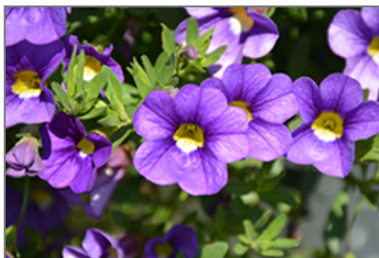
Calitastic Indigo Calibrachoa flowers

Calitastic Indigo Calibrachoa is recommended for the following landscape applications;