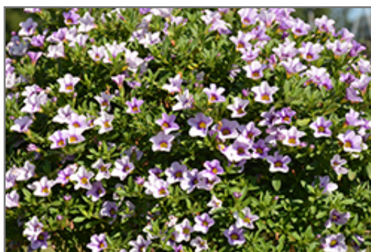
Calitastic Ice Blue Calibrachoa flowers