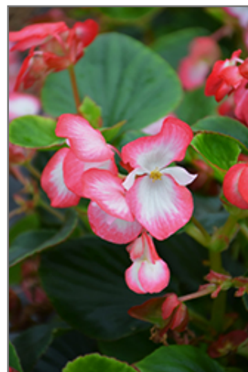
Volumia Rose Bicolor Begonia flowers