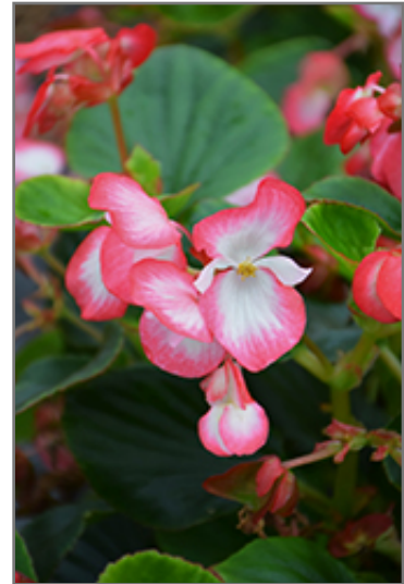
Volumia Rose Bicolor Begonia flowers