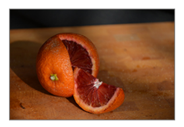
Moro Blood Orange fruit