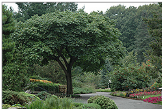
Amur Cork Tree