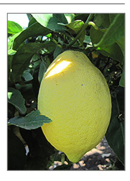
Lemon fruit

Lemon features showy clusters of fragrant white star-shaped flowers with buttery yellow eyes at the ends of the branches from early to mid spring, which emerge from distinctive lilac purple flower buds. It has attractive dark green foliage with light green undersides which emerges brick red in spring. The glossy oval leaves are highly ornamental and remain dark green throughout the winter. It features an abundance of magnificent yellow berries from late fall to late winter. The fruit can be messy if allowed to drop on the lawn or walkways, and may require occasional clean-up.