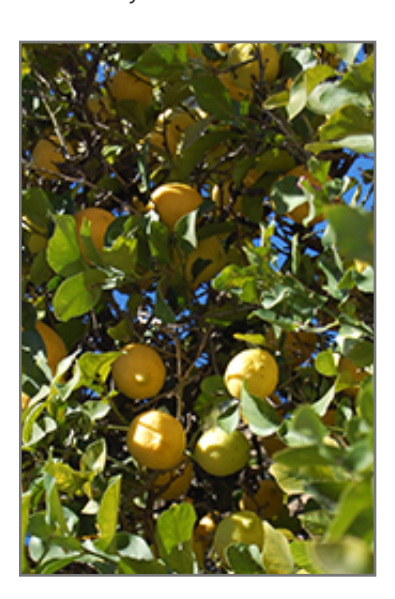
Lemon fruit