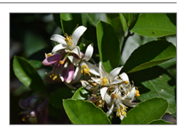
Lemon flowers

This plant is not reliably hardy in our region, and certain restrictions may apply; contact the store for more information.