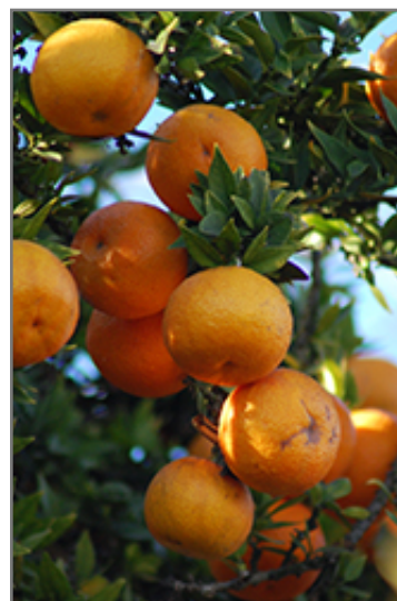
Chinotto Myrtle-leaved Orange fruit

Chinotto Myrtle-leaved Orange is a multi-stemmed evergreen tree with an upright spreading habit of growth. Its average texture blends into the landscape, but can be balanced by one or two finer or coarser trees or shrubs for an effective composition.