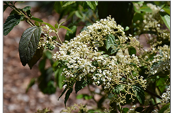
Snow Joey Viburnum flowers

Snow Joey Viburnum is recommended for the following landscape applications;