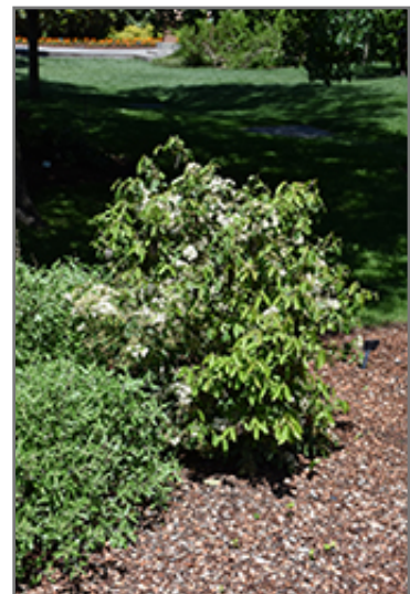
Snow Joey Viburnum in bloom