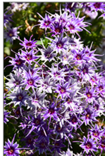
Popstars Blue Phlox flowers