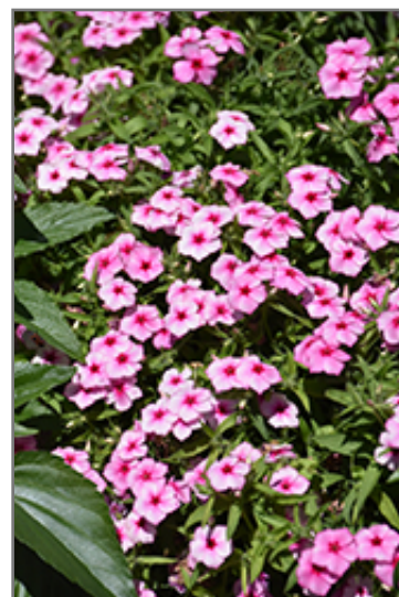
Gisele Pink Phlox flowers