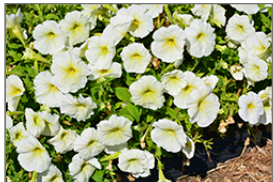
Success! Yellow Chiffon Petunia flowers