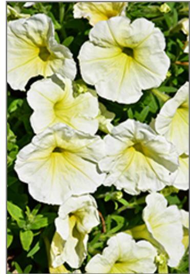
Success! Yellow Chiffon Petunia flowers

Success! Yellow Chiffon Petunia is recommended for the following landscape applications;