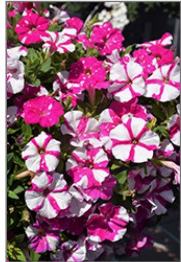
Headliner Pink Sky Petunia flowers