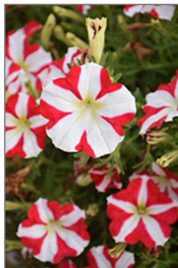
Amore King of Hearts Petunia flowers

Amore King of Hearts Petunia is recommended for the following landscape applications;