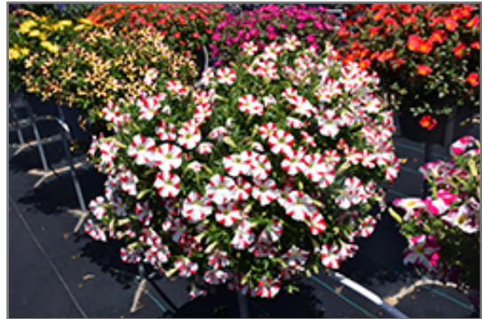
Amore King of Hearts Petunia in bloom

Amore King of Hearts Petunia will grow to be about 12 inches tall at maturity, with a spread of 14 inches. When grown in masses or used as a bedding plant, individual plants should be spaced approximately 10 inches apart. Its foliage tends to remain dense right to the ground, not requiring facer plants in front. This fast-growing annual will normally live for one full growing season, needing replacement the following year.