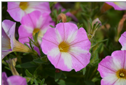
SuperCal Lavender Star Petchoa flowers

SuperCal Lavender Star Petchoa is recommended for the following landscape applications;