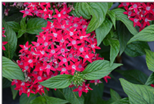
Lucky Star Raspberry Star Flower flowers