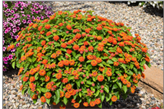
Hot Blooded Red Lantana in bloom

Hot Blooded Red Lantana is a fine choice for the garden, but it is also a good selection for planting in outdoor containers and hanging baskets. It is often used as a 'filler' in the 'spiller-thriller-filler' container combination, providing a mass of flowers against which the thriller plants stand out. Note that when growing plants in outdoor containers and baskets, they may require more frequent waterings than they would in the yard or garden.