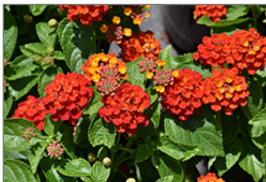
Hot Blooded Red Lantana flowers

Hot Blooded Red Lantana is recommended for the following landscape applications;