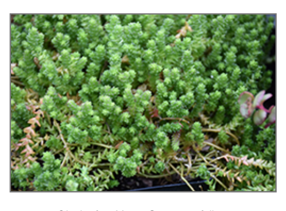
Oktoberfest Mossy Stonecrop foliage