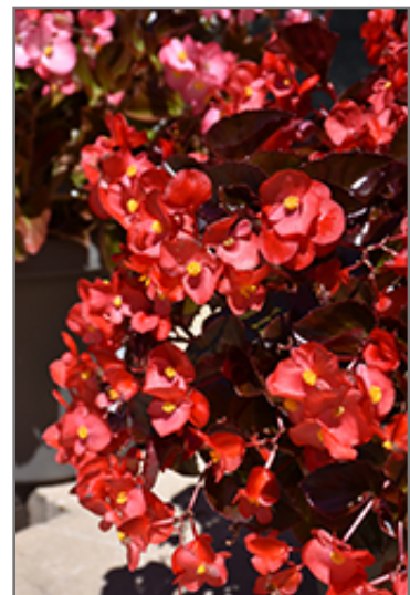
Viking Red on Chocolate Begonia flowers