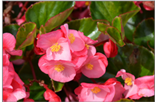
Viking Pink on Green Begonia flowers

Viking Pink on Green Begonia is recommended for the following landscape applications;